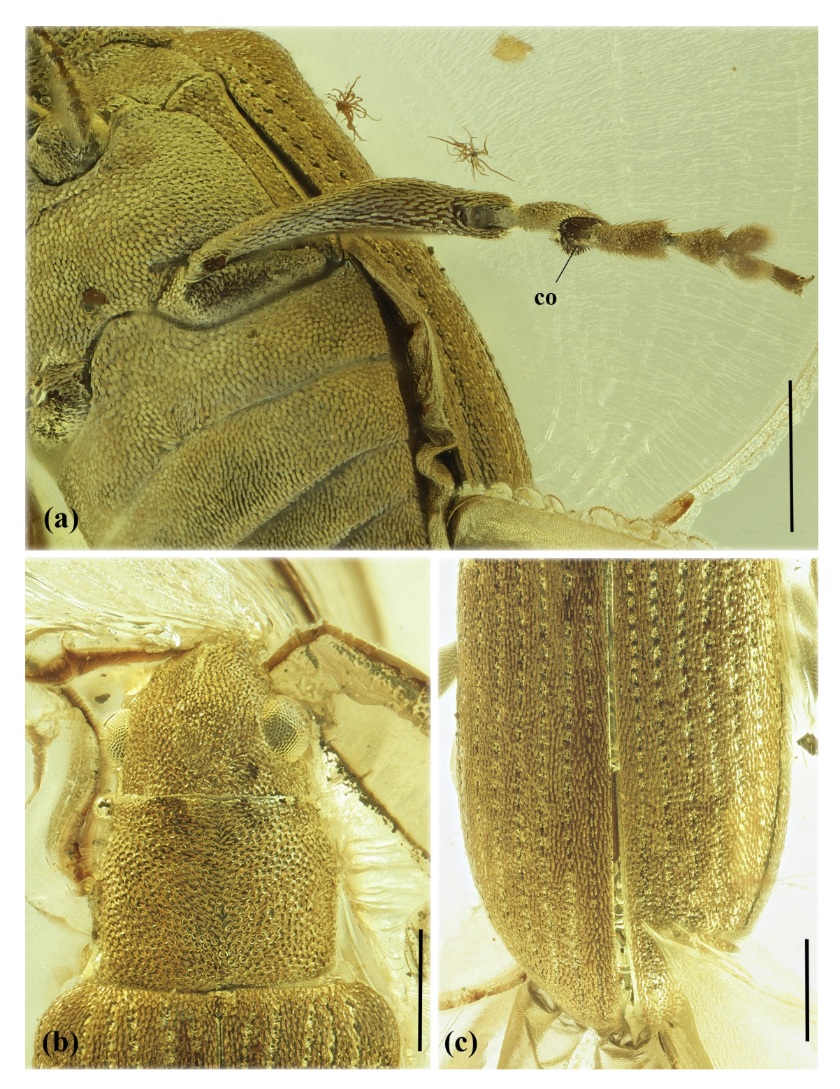
Figure 2. Arostropsis perkovskyi sp. nov., holotype: (a) details of metathorax and abdomen, ventral view; (b) forebody, dorsal view; (c) details of elytra, dorsal view. Scale bars = 1 mm. Abbreviations: co - corbel.